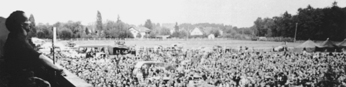
South German Sunday Post, 1949: "It's incomprehensible!" Bruno Gröning heals the lame, the blind, the mute ...

The extraordinary healings that occurred through Bruno Gröning (1906-1959) ushered in a new era of spiritual healing.